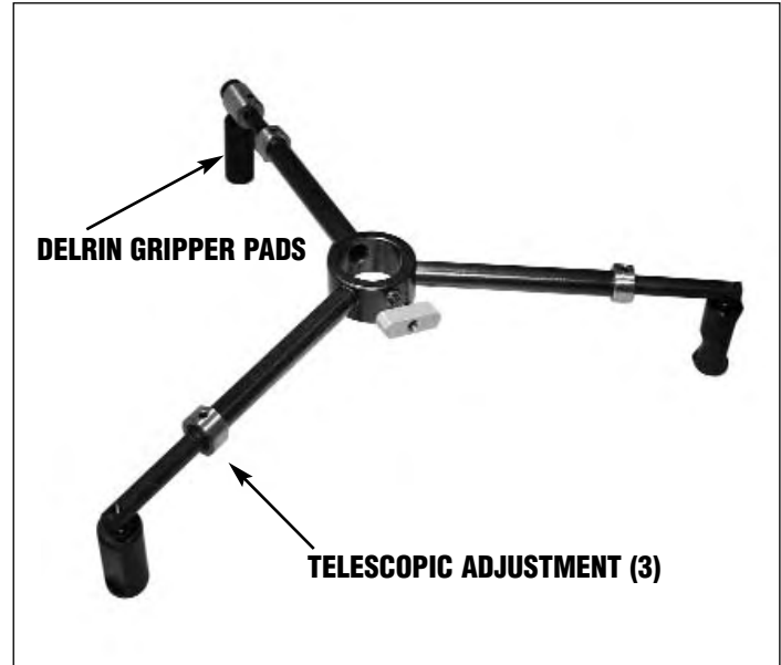
Basket Detail — bottom view. Standard size range 10" to 16" diameter drums.